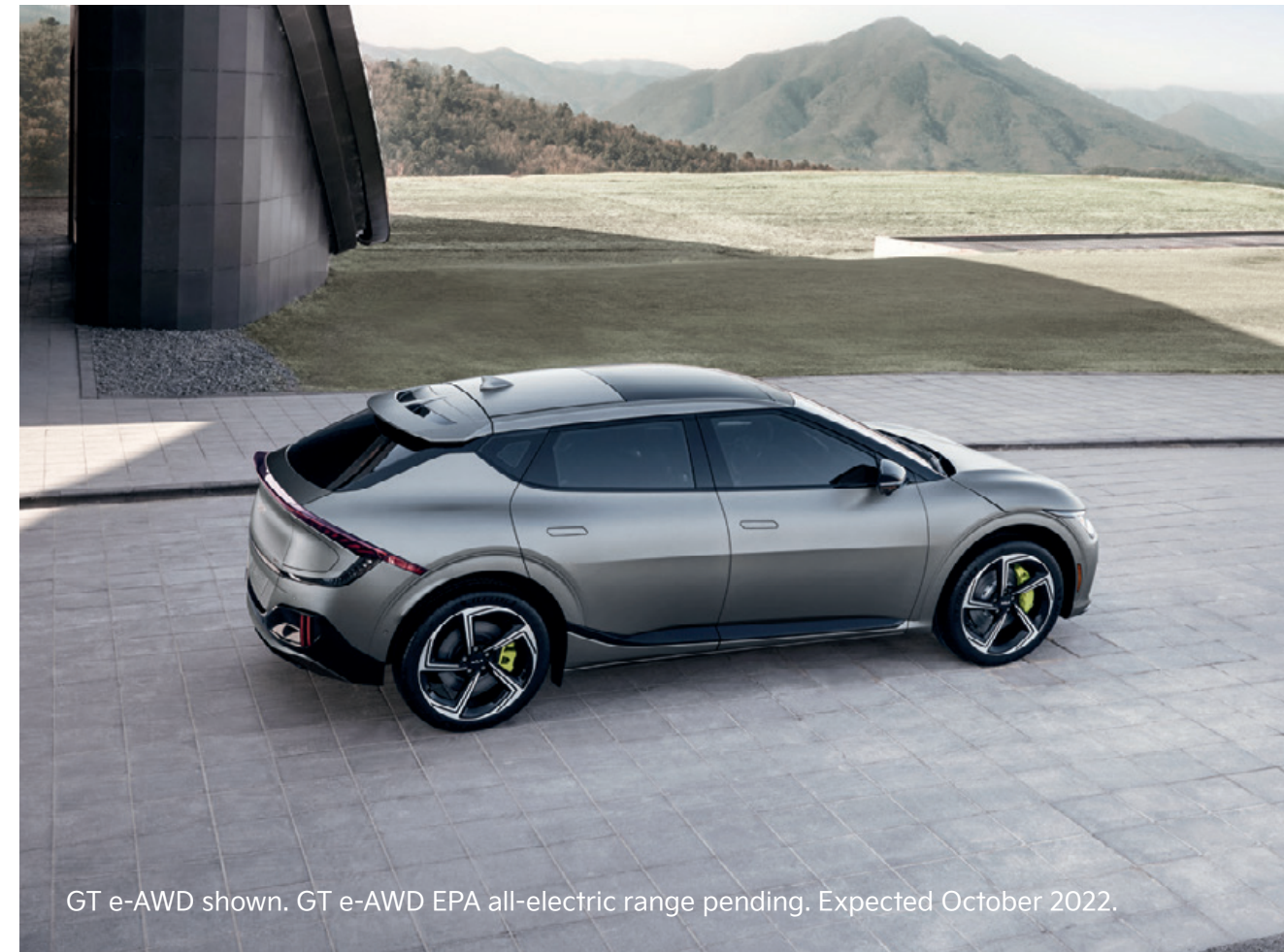
GT e-AWD shown. GT e-AWD EPA all-electric range pending. Expected October 2022.

310-mile All-electric Range 3 (Wind, GT-Line RWD)