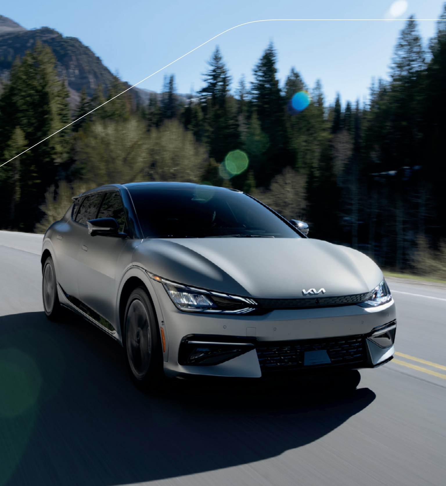
GT-Line e-AWD shown.

576 hp 545 lb.-ft. of Torque* (GT e-AWD)